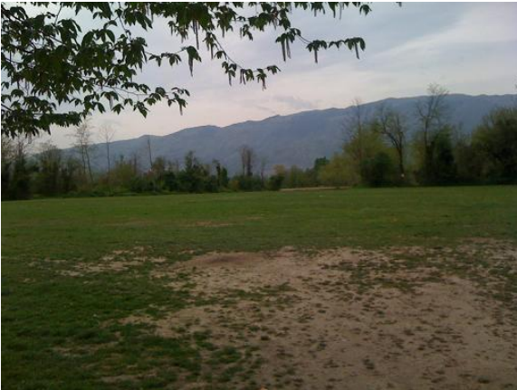
Grass Area for Pic Nic and Sports