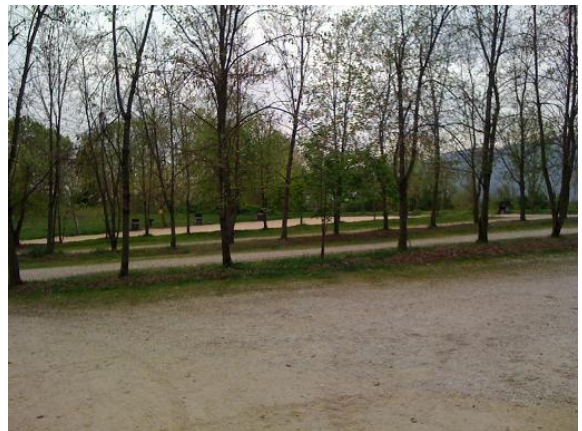
Car Park with BBQ's along Perimeter