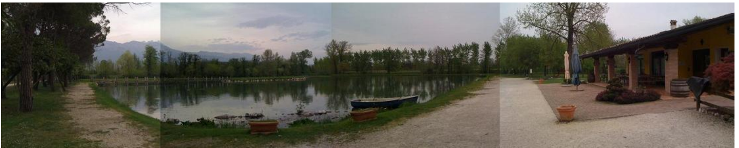
(View of Fishing Pond & Agriturismo/Restaurant)