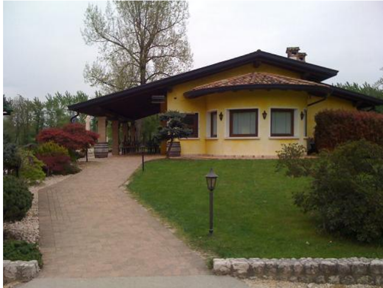
Agriturismo / Restaurant "Orzai"