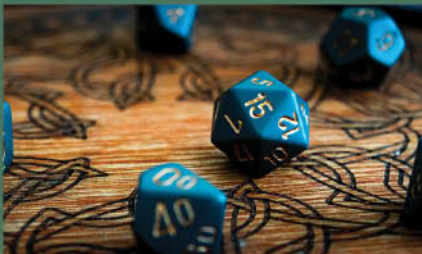
Table Top Night | 6:30 PM Saturday, March 4th & 18th

LBV will be hosting their annual St. Patrick's Day Party! Come get the only green beer in town, Irish food specials, and discounts on select drinks! 18+ Only.